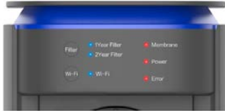
Figure 1. Smart RO unit LED indicators